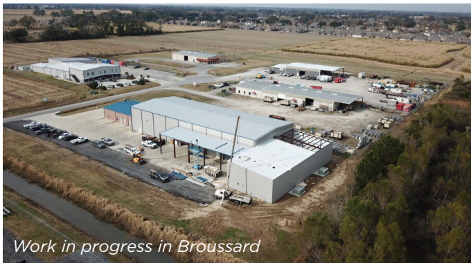
Work in progress in Broussard